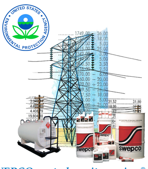
SWEPCO ... to keep it running ®